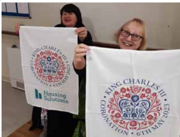
Commemorative tea towels